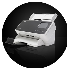
Alaris S2060w/S2080w Scanners