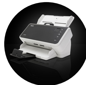
Alaris S2050/S2070 Scanners