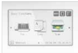
bizhub 4020i 3.7-inch touch panel