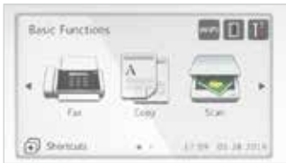
bizhub 5020i 4.84-inch touch panel

The large colour LCD touch panel is easy to operate even for first-time users. An intuitive interface and smartphone-like operability helps you get to the functions you need quickly, with no fuss.